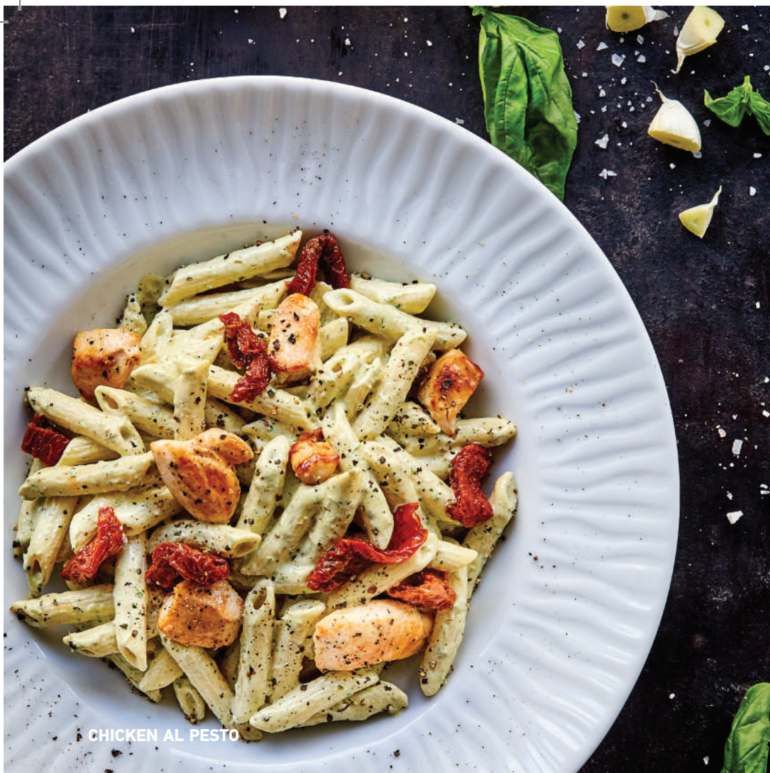
CHICKEN AL PESTO