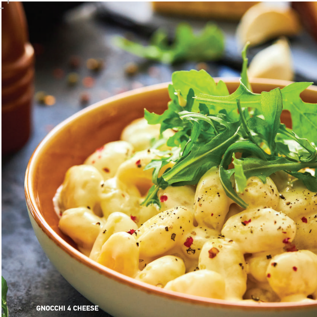
GNOCCHI 4 CHEESE