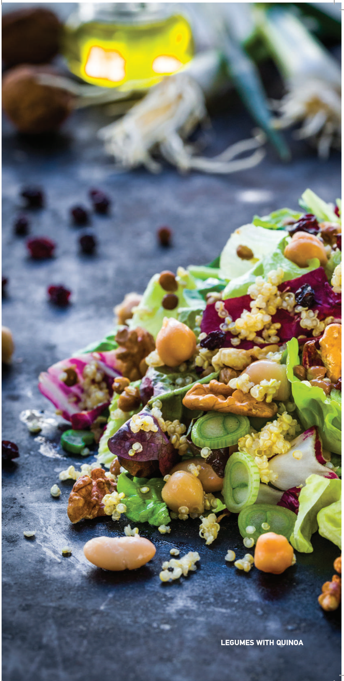
LEGUMES WITH QUINOA